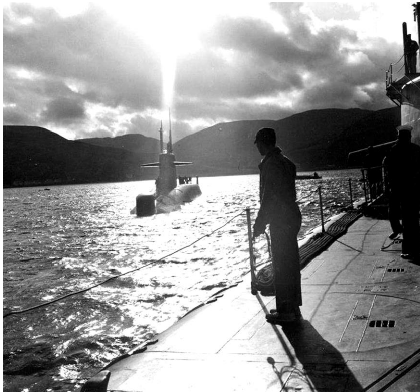
USS Sam Houston's Arrival at Holy Loch, Scotland After Historic Mediterranean Sea Patrol July 9, 1963